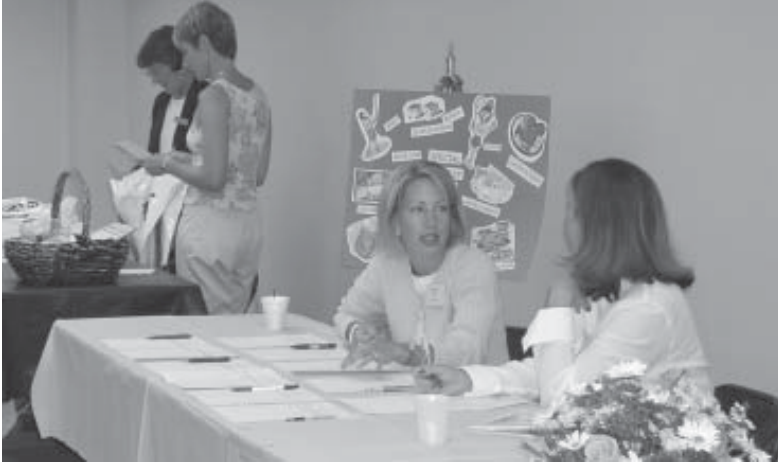
Hudson gets Acquainted with the Newcomers Club

Hudson Newcomer's held the annual Get Acquainted Coffee at St. Mary's Church on August 22. This event helps our new neighbors get to know the many organizations and services available in the Hudson area as well as offering information on our own Newcomers Club.